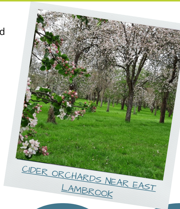
CIDER ORCHARDS NEAR EAST LAMBROOK